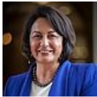
Hon Hekia Parata Minister of Education

Contributors: View their profiles and topics online at www.smartnet.co.nz/elf-2016/contributors/